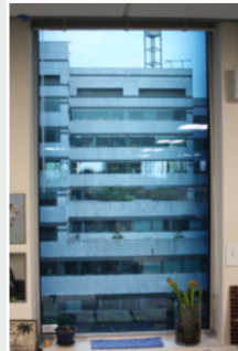
Tint 2 - 6:31 pm