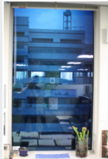
Tint 3 - 6:43 pm