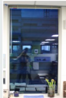
Tint 4 - 6:53 pm