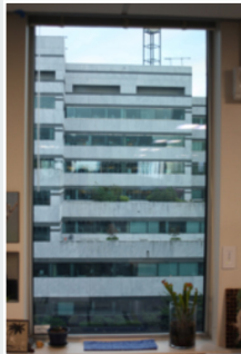
Tint 1 - 6:25 pm