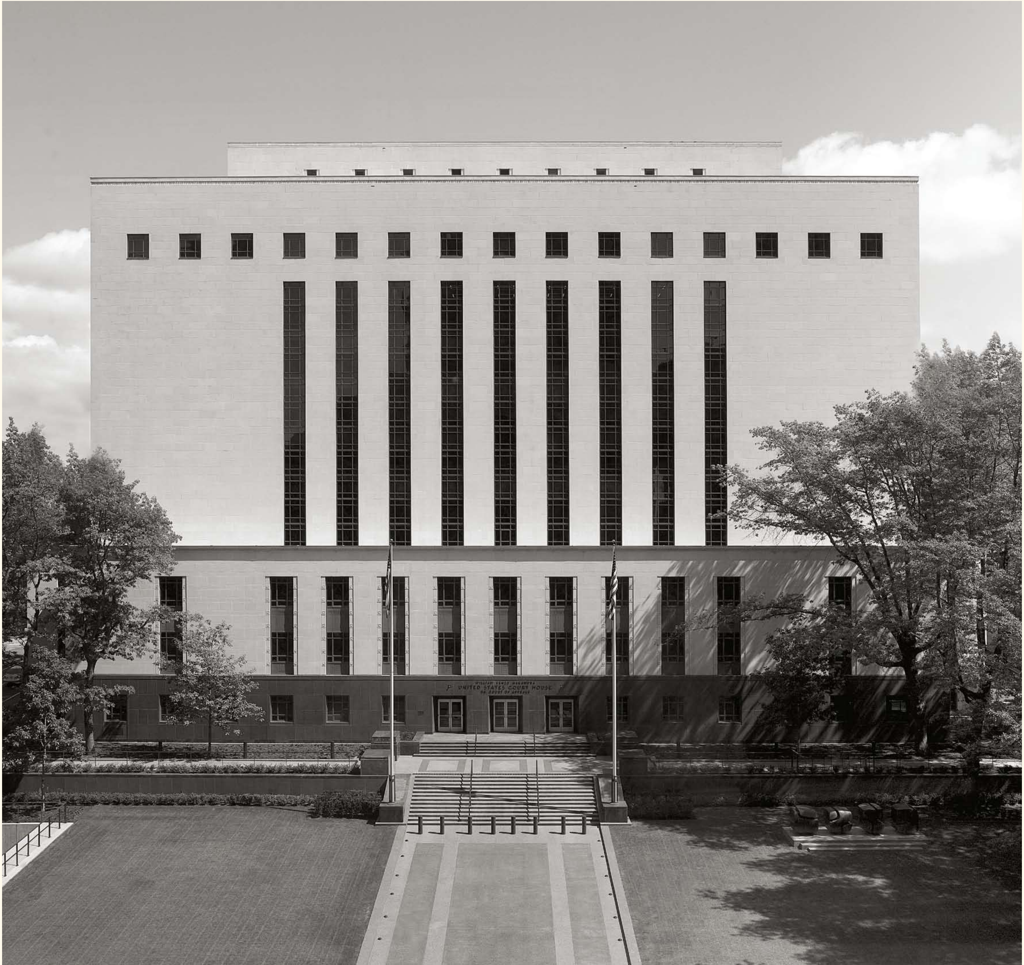
WILLIAM KENZO NAKAMURA U.S. COURTHOUSE SEATTLE, WASHINGTON 1939-1940 GILBERT STANLEY UNDERWOOD