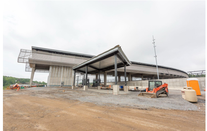
A view looking south of the Outbound Inspection canopy and overhead parking deck.