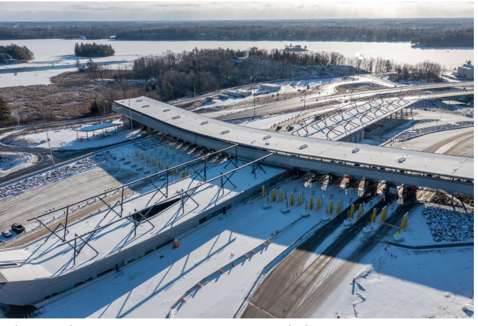
A view looking southeast at the Phase Two buildings and non-commercial inspection lanes.