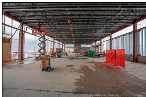
A view looking north inside the new commercial building warehouse.

The weather in this area can be dangerous for drivers. Please drive carefully and pay attention to construction signage and maintenance vehicles.