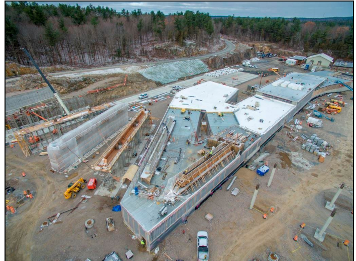
A view looking northwest at the new commercial building and overhead parking deck structure construction.