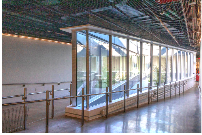
A view of the interior courtyard at the Main Building.