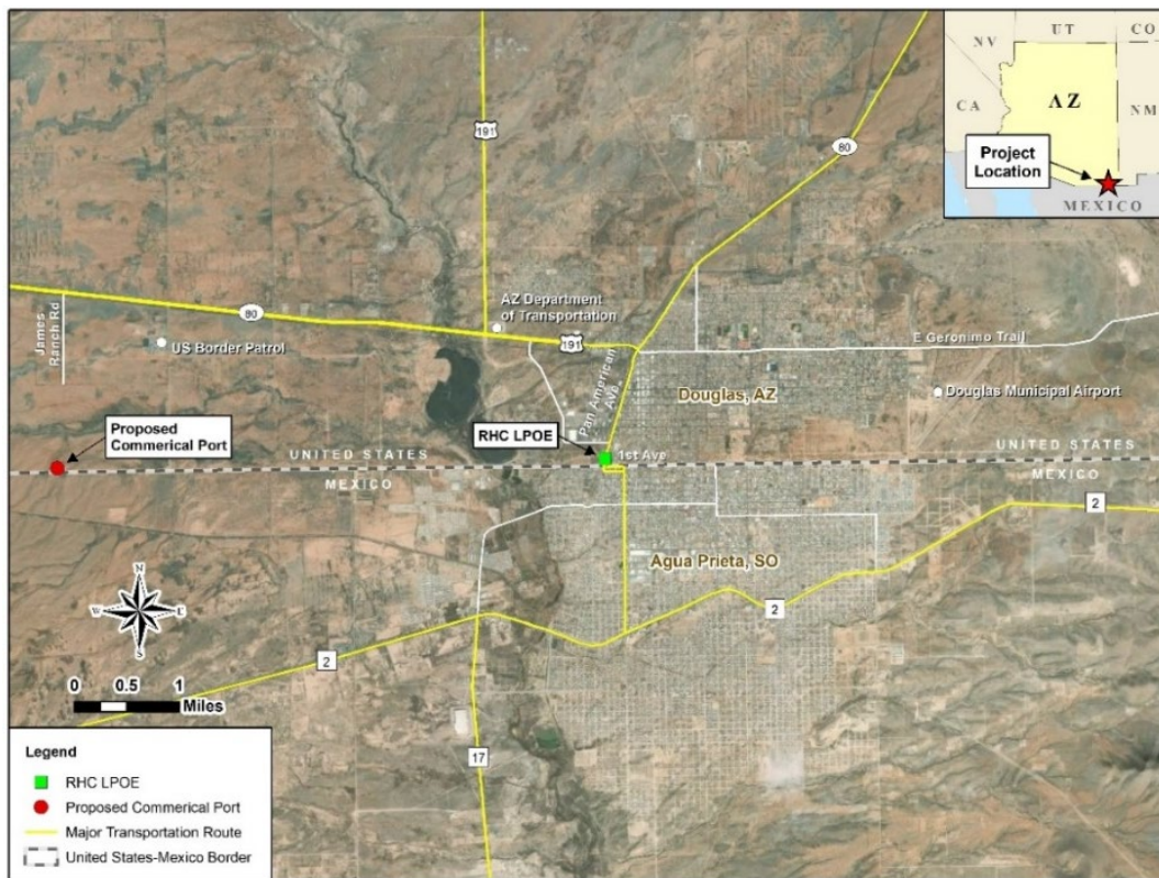
Figure 1. Location of the RHC LPOE and Proposed New Commercial LPOE

Analysis of the “no action” alternative is included to satisfy federal requirements under the National Environmental Policy Act (NEPA) and provide a baseline for comparison with impacts from both action alternatives. The “no action” alternative assumes that the current issues with the RHC LPOE would not be addressed and that operations would continue under current conditions.