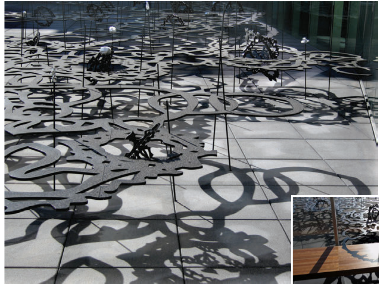
Sculpture: Stare Decisis

The serpentine form of the piece echoes the Willamette River System, winding its way from the rooftop outside the courtrooms into the building. The map, overlaid with text, cites precedents for the U.S. constitution. Concentric three-dimensional elements are “atoms of law” with rings numbering the articles and amendments of the constitution. Their locations correspond to the largest cities and towns in Oregon.