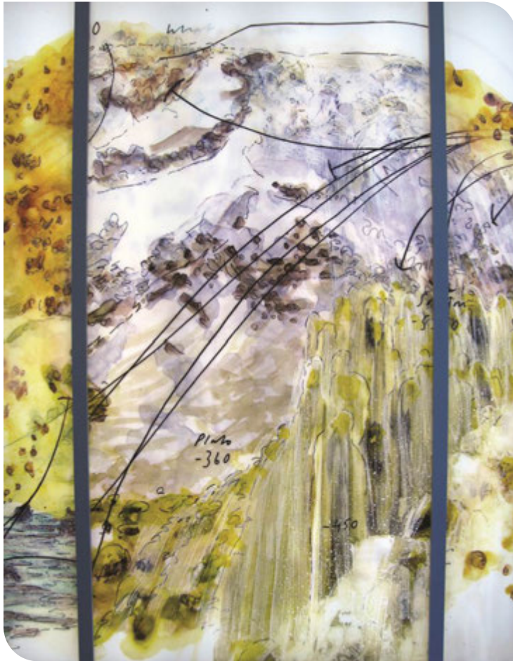
Mural: Life, Liberty, and Pursuit

What’s next? We’ll show you what it takes to preserve and protect our Region’s masterpieces.