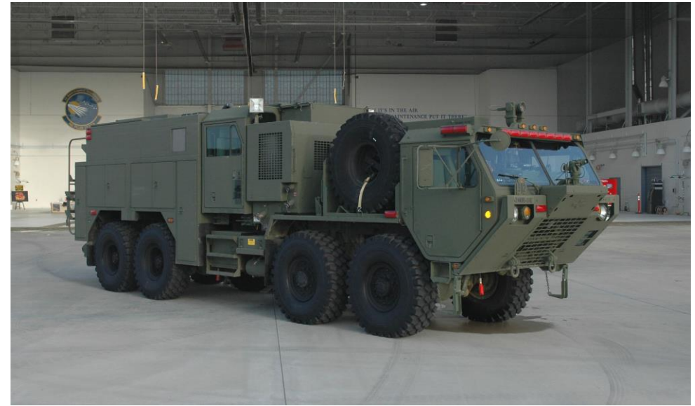
US Army M1142 Tactical Firefighting Truck