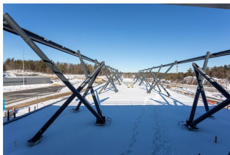
A view of the Main Building lighting towers looking north.