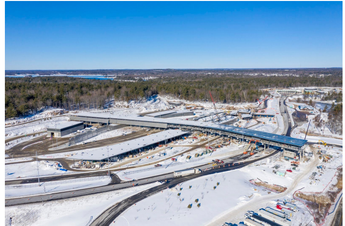
An aerial view of the project site looking northwest.