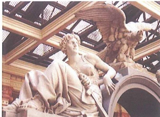
"Peace and Vigilance with Eagle" by Daniel Chester French, located in the Old St. Louis Post Office