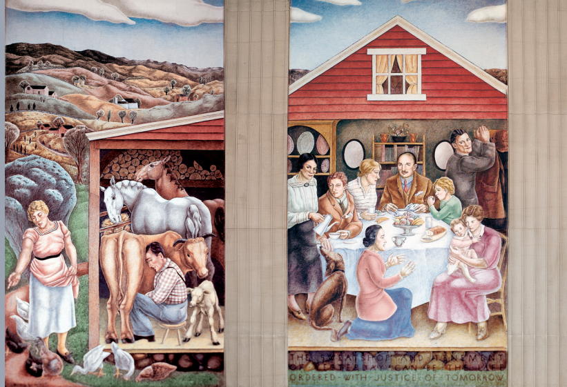
FRESCO 1936 INSTALLED IN STAIRWELL, LEFT