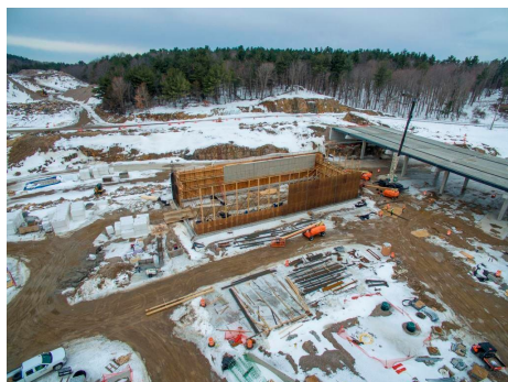
A view looking west at the non-intrusive inspection building wall construction.

The weather in this area can be dangerous for drivers. Please drive carefully and pay attention to construction signage and maintenance vehicles.