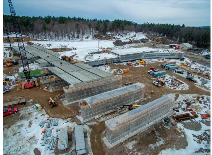
A view looking northwest at the new commercial building and overhead parking structure.