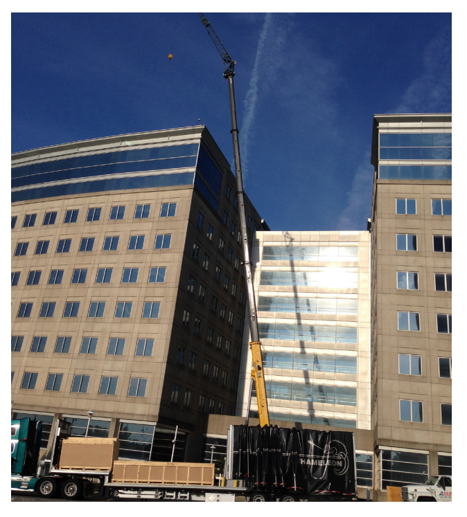
Heat recovery coil installation

Ameresco and the GSA worked to build project buy-in by incorporating non-energy upgrades in the project, including a building roof replacement and rain gardens—the latter effectively met the GSA's stormwater management requirements. Rain gardens were installed concurrently with the neighboring parking lot canopy PV system in order to offset that system's aesthetic impacts, which had been a concern early in the project. The project team also found tenant engagement and education vital to maintaining a smooth construction process in a continuously occupied space.