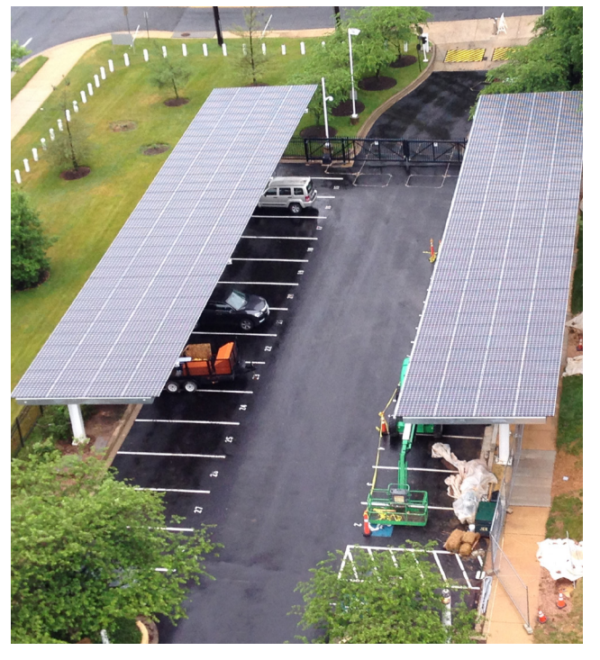
South parking lot PV canopy