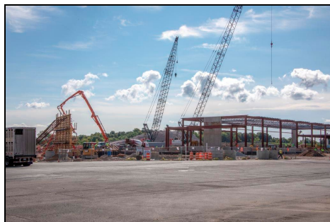
A view looking south at the new commercial building construction.

Construction of utilities will be active beneath the Interstate 81 overpass. Please proceed with caution.