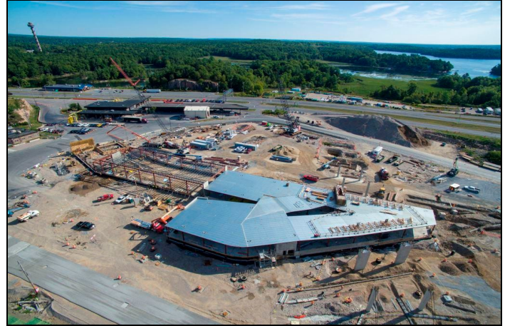
A view looking northeast of the new commercial building construction.