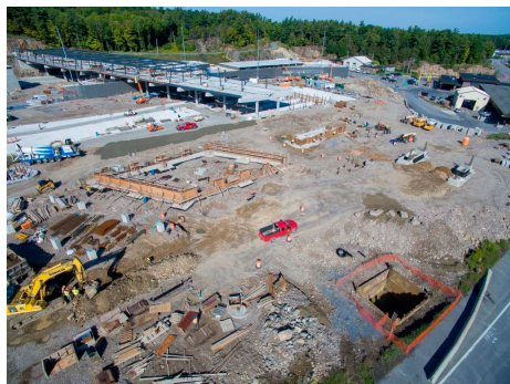
A view looking northwest at the Main Building foundation construction.

Please pay attention to all wayfinding and traffic signs, drive slowly, and be cautious around construction activity.