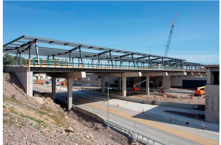
A view looking east at the overhead parking structure construction.