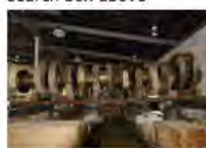
Crank Shaft, approx. 75 Tons

Click on the picture to see the Item Description To view ALL coins, enter "W1FBPI06108" in the search box above