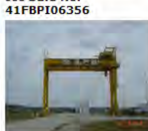
Gantry Crane - Stennis Space Center Sale No. 41FBPI06353001 Sale Ends: 06/30/2006

Click on the picture to see the Item Description To view various Boston Whalers for sale please see Sale No. 41FBPI06356