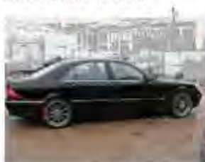
2001 Mercedes Benz S600/Peoria Sale No. 41FBPI06360001 Sale Ends: 06/30/2006

Click on the picture to see the Item Description To view other vehicles, enter 71FMPI06352 in search box above