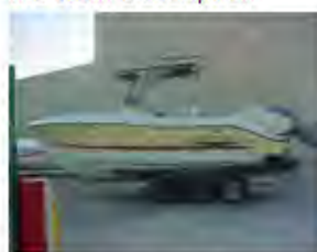
2004 Hydrasport Vector 2600CC 26' Length Sale No. 41FBPI06346002 Sale Ends: 06/29/2006

Click on the picture to see the Item Description