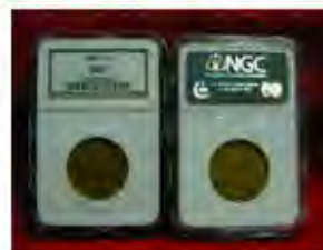
US GOLD COIN(S) Sale No.

Click on the picture to see the Item Description