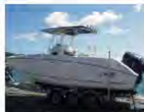
2002 Boston Whaler Outrage Sale No. 41FBPI06356008 Sale Ends: 06/30/06

Click on the picture to see the Item Description To view various Boston Whalers for sale please see Sale No. 41FBPI06356