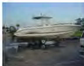
2004 Hydrasport Vector 3300CC 33' Length Sale No. 41FBPI06346001 Sale Ends: 06/29/2006

Click on the picture to see the Item Description