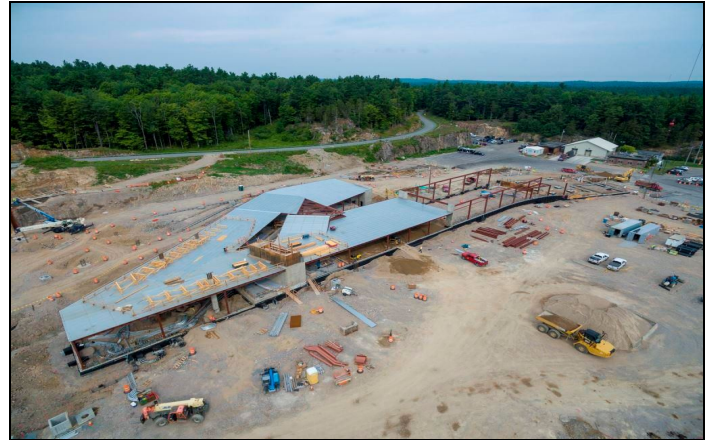
A view looking northwest of the new commercial building construction.