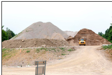
A view of the crushed rock storage area.

Construction of utilities will be active beneath the Interstate 81 overpass. Please proceed with caution.