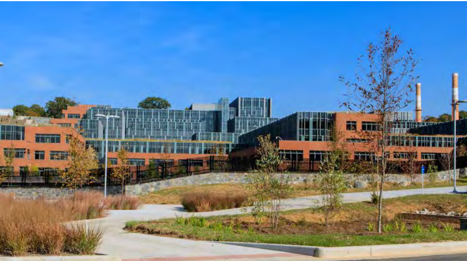
DOUGLAS A. MUNRO U.S. COAST GUARD HEADQUARTERS WASHINGTON, D.C.

AS THE FIRST PHASE OF THE U.S. DEPARTMENT OF HOMELAND SECURITY HEADQUARTERS RELOCATION, THE DOUGLAS A. MUNRO U.S. COAST GUARD HEADQUARTERS BUILDING AT ST. ELIZABETHS CONSOLIDATED MORE THAN 3,800 EMPLOYEES, WHO WERE PREVIOUSLY SCATTERED AMONG 24 LOCATIONS AROUND WASHINGTON, D.C. COMPLETED UNDER A DESIGN-BUILD CONTRACT, THE 1.2 MILLION SQUARE-FOOT, 11-LEVEL OFFICE BUILDING, WHICH CASCADES DOWN THE SLOPING HILLSIDE, IS ONE OF THE LARGEST CONSTRUCTION PROJECTS IN GSA'S HISTORY AND IS THE DEFERENTIAL CENTRAL COMPONENT OF THE 176-ACRE NHL CAMPUS. COMPRISED OF COMPATIBLE BRICK, GLASS, SCHIST STONE AND ZINC DESIGN FEATURES, THE BUILDING'S SITE, EIGHT INTERCONNECTED COURTYARDS AND 550,000 SQUARE FOOT GREEN ROOF (CURRENTLY THE SECOND LARGEST IN THE U.S. AND THE THIRD LARGEST IN THE WORLD) ARE KEY TO THE CAMPUS'S STORM WATER MANAGEMENT SYSTEM AND ITS LEED GOLD CERTIFICATION.