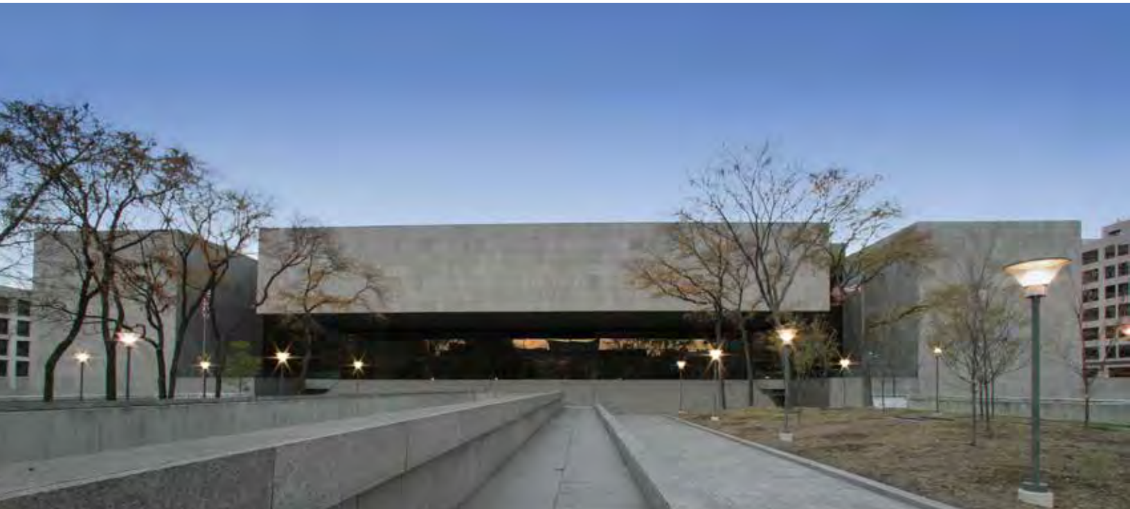
U.S. TAX COURT BUILDING WASHINGTON, D.C.