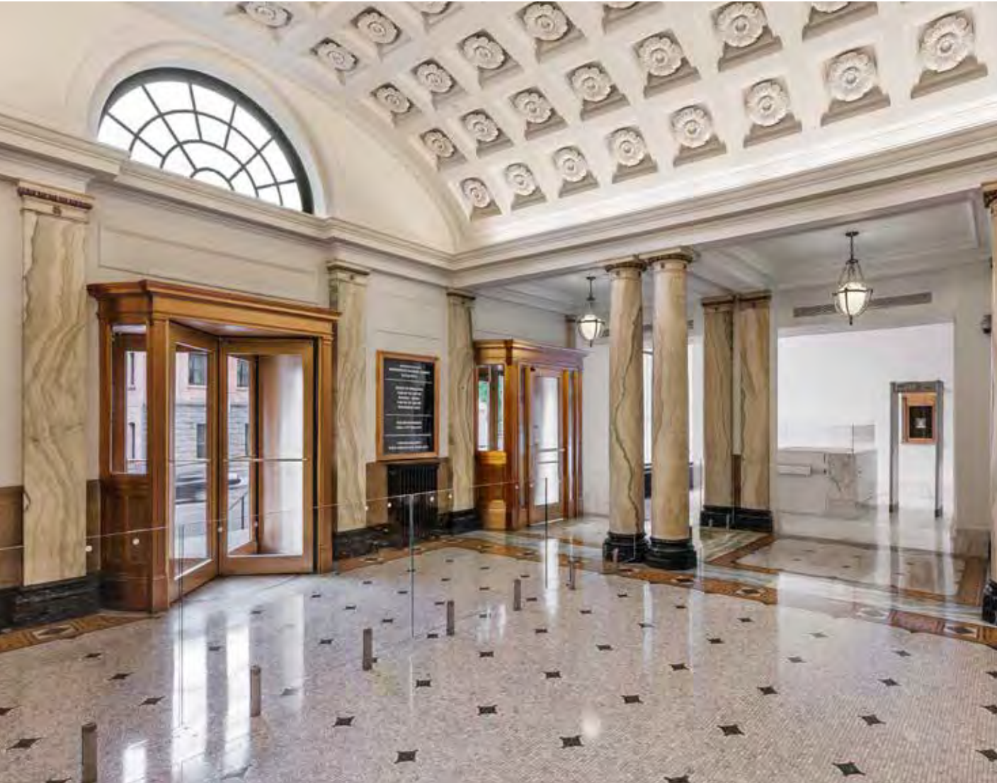
FEDERAL BUILDING MINNEAPOLIS, MINNESOTA