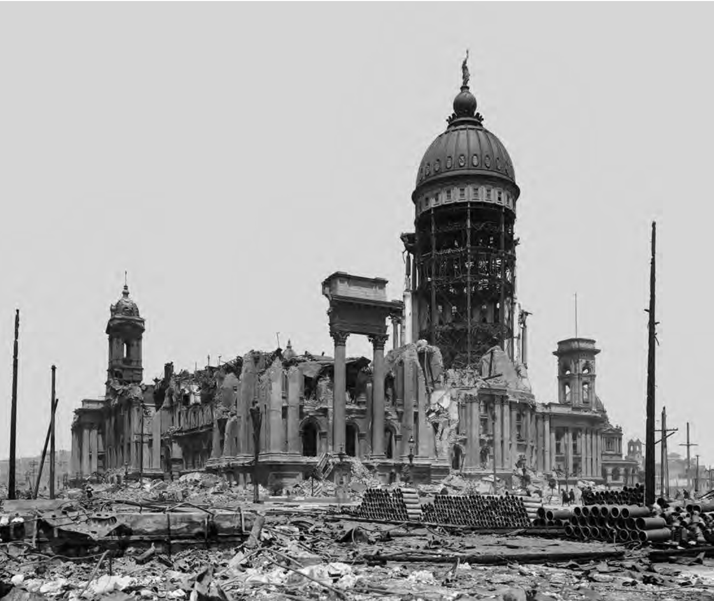
CITY HALL SAN FRANCISCO, CALIFORNIA

DURING LANDSCAPING WORK FOR REHABILITATION OF THE 1936 FEDERAL BUILDING AT 50 UNITED NATIONS PLAZA, GSA DISCOVERED FOUNDATION REMAINS OF SAN FRANCISCO'S 1897 CITY HALL, WHICH COLLAPSED DURING THE EARTHQUAKE AND FIRE OF 1906, AFTER TWENTY-FIVE YEARS IN CONSTRUCTION AND NINE YEARS USE.