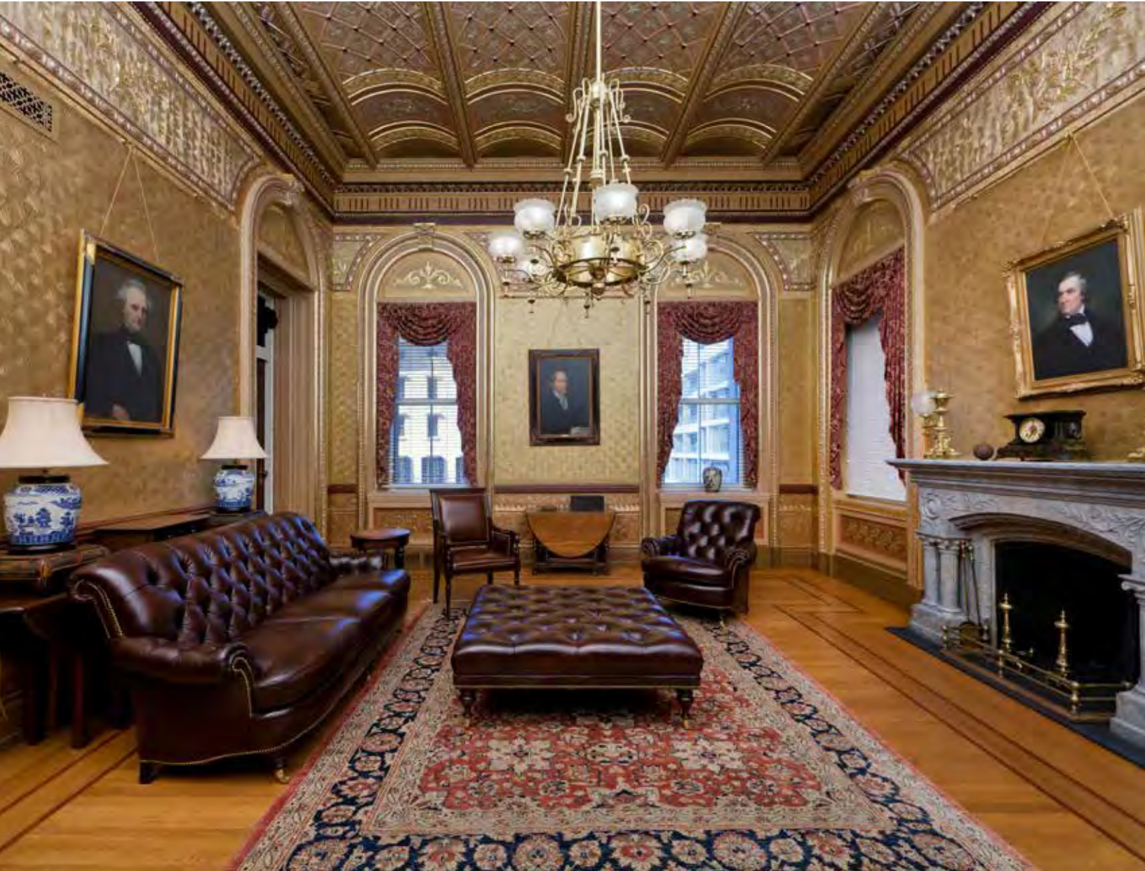
DWIGHT D. EISENHOWER EXECUTIVE OFFICE BUILDING WASHINGTON, D.C.

COMPLETION OF THE LONG-DEFERRED REHABILITATION OF THE 1888 EISENHOWER EXECUTIVE OFFICE BUILDING PUT GSA'S MOST ARCHITECTURALLY SIGNIFICANT BUILDING BACK INTO FULL SERVICE FOR THE FIRST TIME IN MORE THAN A DECADE. THE THREE-PHASE PROJECT BROUGHT THE BUILDING UP TO MODERN SECURITY AND LIFE SAFETY REQUIREMENTS, WHILE ALSO SEIZING OPPORTUNITIES TO RESTORE ELABORATELY DECORATED CEILINGS DISCOVERED DURING THE PROJECT.