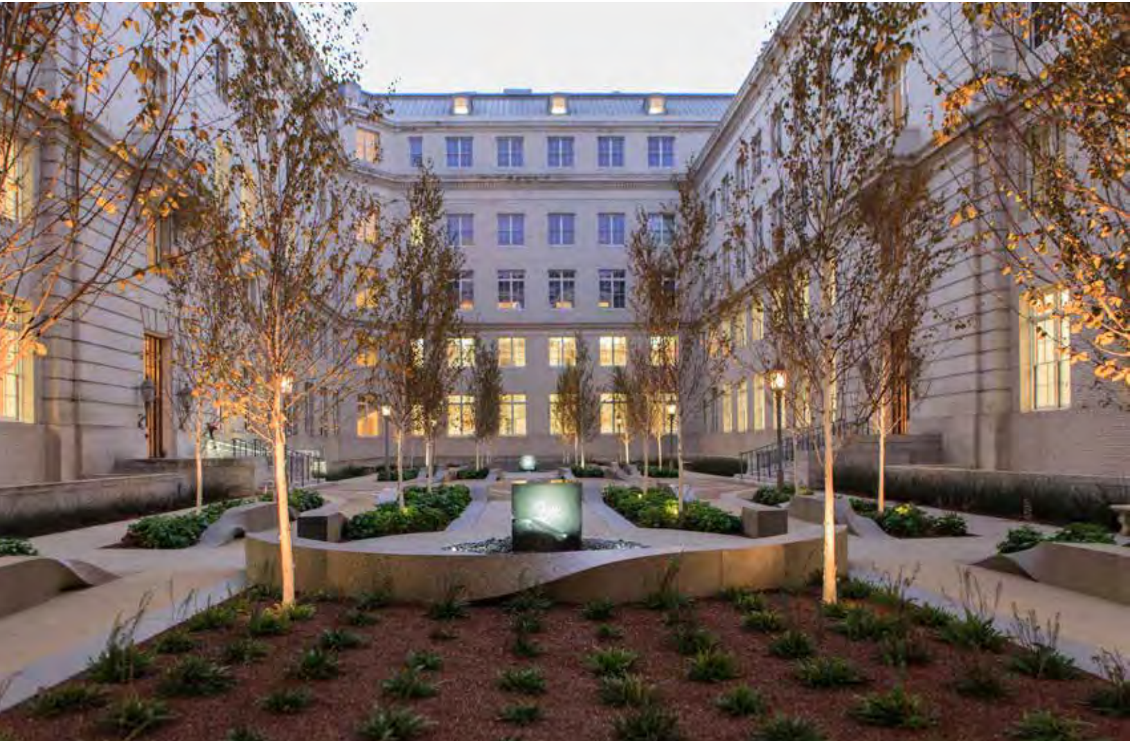
FEDERAL BUILDING SAN FRANCISCO, CALIFORNIA

ENERGY SAVING IMPROVEMENTS AT THE 1936 FEDERAL BUILDING AT 50 UNITED NATIONS PLAZA IN SAN FRANCISCO TAKE ADVANTAGE OF THE REGION'S TEMPERATE CLIMATE, ELIMINATING THE COSTS OF INSTALLING, MAINTAINING, AND OPERATING AIR CONDITIONING. MITIGATION FOR NECESSARY ALTERATIONS INCLUDES COURTYARD LANDSCAPE RENEWAL, UNDER GSA'S ART IN ARCHITECTURE PROGRAM, RESPONDING TO THE HISTORIC LANDSCAPE. THE COURTYARD REFUGE INTEGRATES NEW RIBBON BENCHES AND A SCULPTURAL CUBE FOUNTAIN BY ARTIST CLIFF GARTEN WITH HISTORIC BENCHES, LIGHT FIXTURES AND A PAVING DESIGN BASED ON THE ORIGINAL.