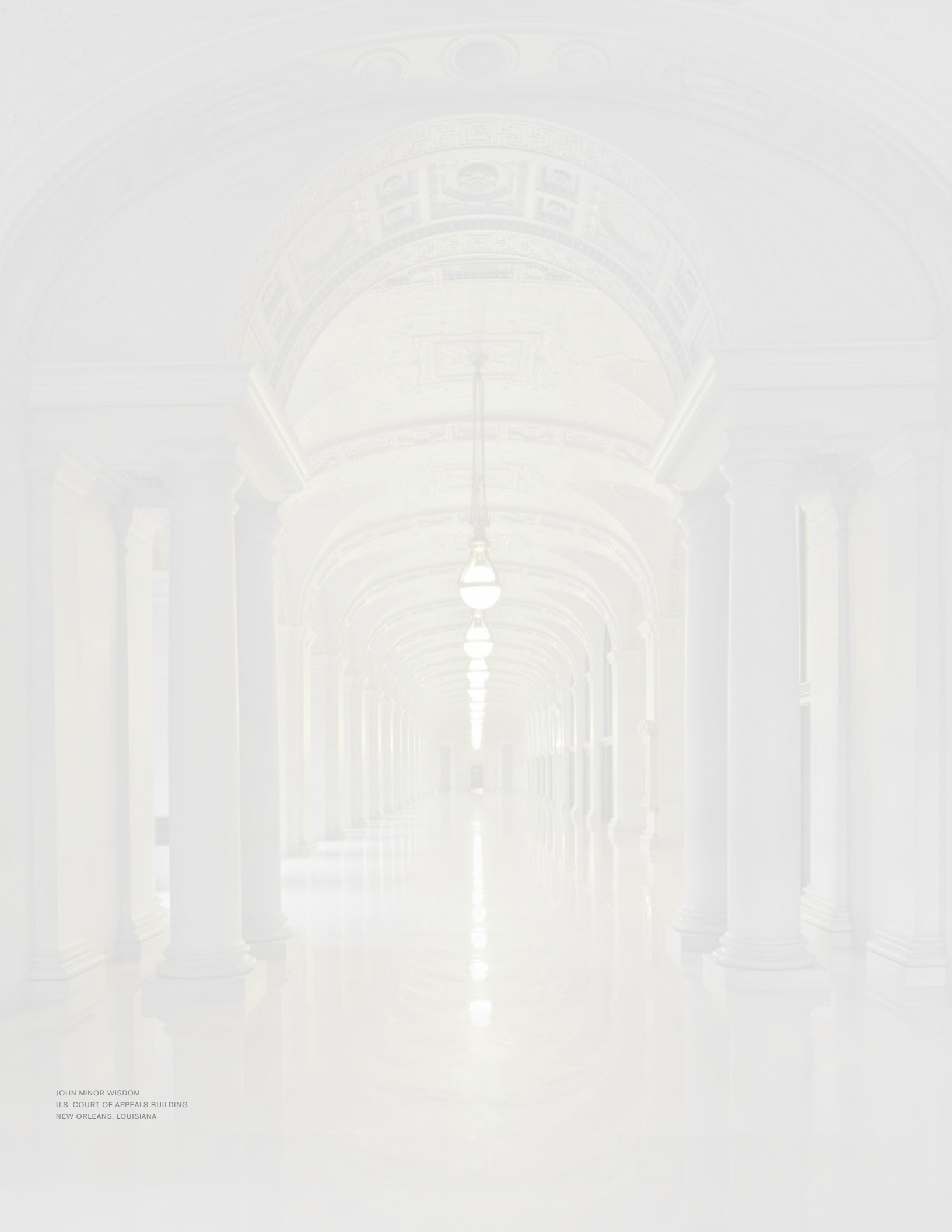
JOHN MINOR WISDOM U.S. COURT OF APPEALS BUILDING NEW ORLEANS, LOUISIANA