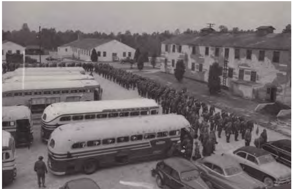
FORT PICKETT BLACKSTONE, VIRGINIA

CO-LOCATING THE DEPARTMENT OF STATE'S FOREIGN AFFAIRS TRAINING CENTER WITH THE NATIONAL GUARD AT FORT PICKETT, VACATED BY THE U.S. ARMY IN 1997, WILL PROVIDE A WELCOME BOOST TO THE TOWN OF BLACKSTONE, VIRGINIA, WHILE REDUCING THE COST OF CREATING TACTICAL TRAINING AREAS TO PREPARE EMBASSY PERSONNEL FOR SECURITY THREATS.