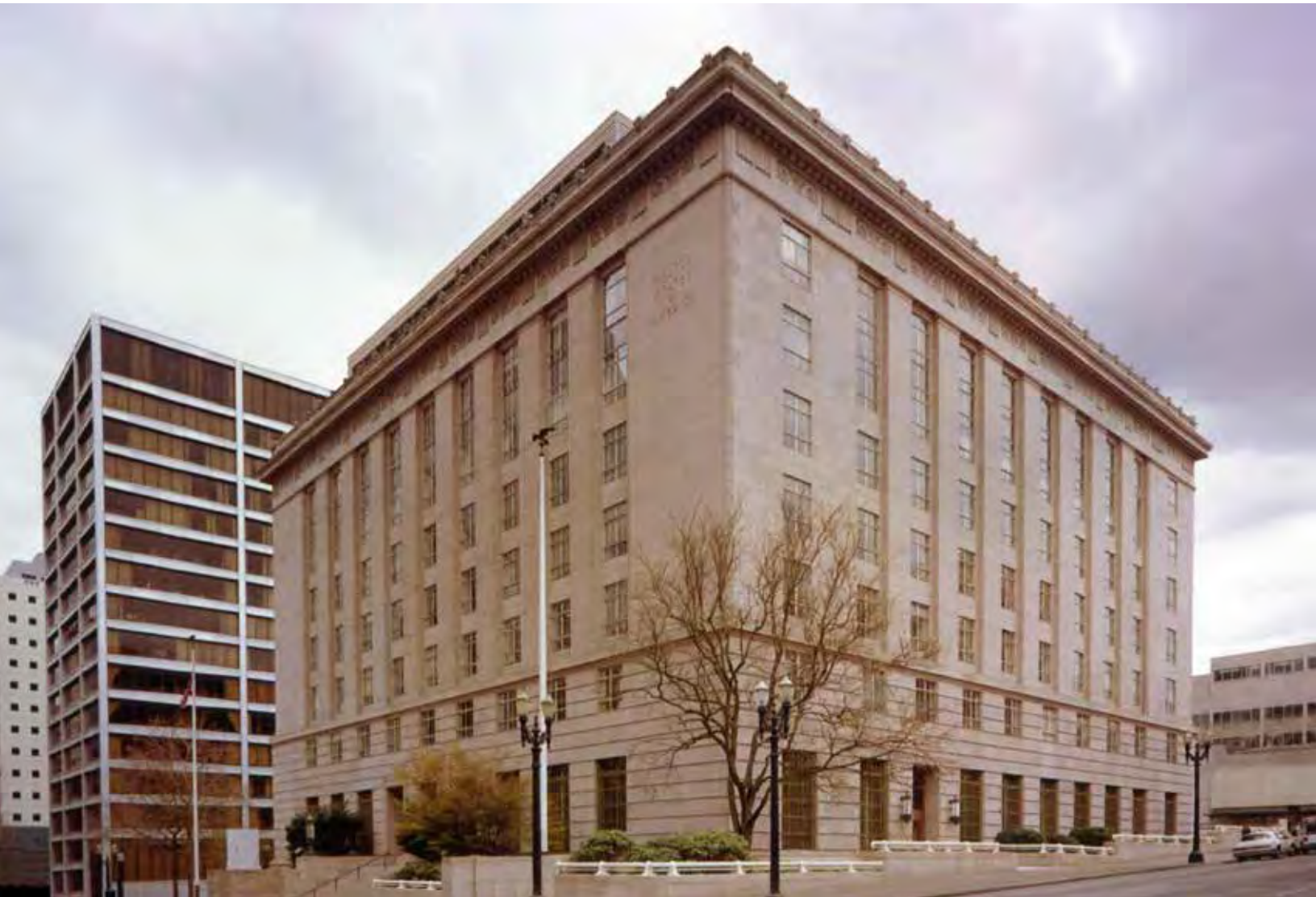
GUS J. SOLOMON U.S. COURTHOUSE PORTLAND, OREGON

THE OPERATIONS AND MAINTENANCE PROCESS AND CONSTRUCTION MANUAL FOR THE GUS J. SOLOMON COURTHOUSE PROVIDES A CATALOG OF CONDITIONS KEYED TO PHOTOGRAPHS, DRAWINGS, AND TREATMENT GUIDELINES FOR THE BUILDING'S WILKESON SANDSTONE, GLAZED TERRACOTTA, AND HISTORIC BRICKWORK.