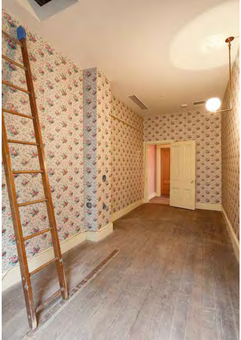
CLARA BARTON MISSING SOLDIERS OFFICE WASHINGTON, D.C.

UNDER ITS MUSEUM OPERATING AGREEMENT WITH GSA, THE NATIONAL MUSEUM OF CIVIL WAR MEDICINE IS FUNDING EXHIBITS, TOURS, AND EDUCATIONAL PROGRAMS HIGHLIGHTING GSA'S DISCOVERY OF CLARA BARTON'S FORMER MISSING SOLDIERS OFFICE IN A WASHINGTON, D.C., ROW BUILDING SLATED FOR SALE AND DEMOLITION.