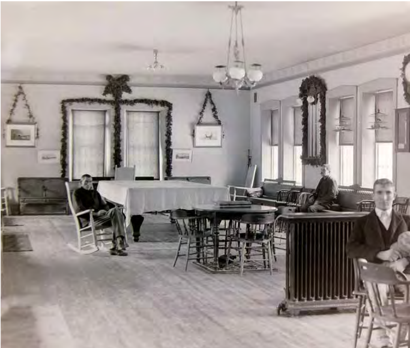
ST. ELIZABETHS WEST CAMPUS WASHINGTON, D.C.

BUILT IN 1878 FOR WASHINGTON, D.C.'S GROWING ST. ELIZABETHS HOSPITAL, THE REHABILITATED ATKINS HALL DORMITORY NOW HOUSES THE COAST GUARD HISTORIAN'S OFFICE, PENTAGON FEDERAL CREDIT UNION, AND OTHER RETAIL SERVICES SUPPORTING THE DEPARTMENT OF HOMELAND SECURITY.