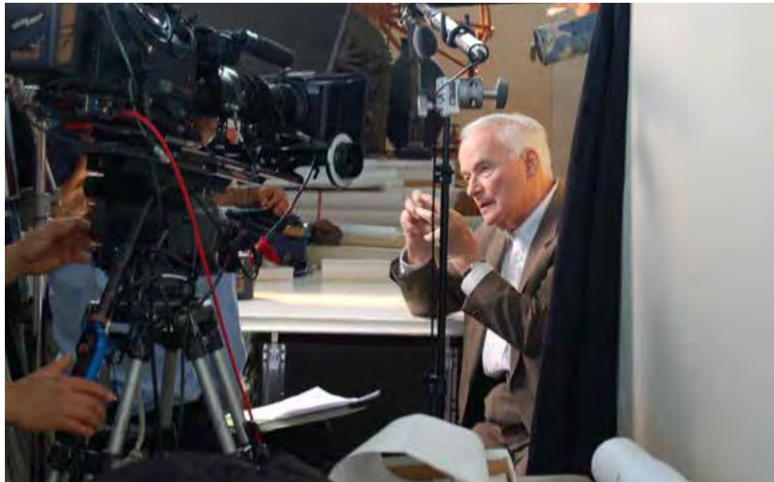
VICTOR LUNDY: SCULPTOR OF SPACE , OFFERS AN INTIMATE PORTRAIT OF THE MASTER ARCHITECT WHO CREATED THE BOLDLY CANTILEVERED U.S. TAX COURT BUILDING IN WASHINGTON D.C., ONE OF GSA'S MOST NOTEWORTHY MODERN-ERA BUILDINGS.

In 2014, the National Building Museum in Washington, D.C., hosted a premier screening of the feature film Victor Lundy: Sculptor of Space , produced by the Center for Historic Buildings in collaboration with GSA's Office of Communications. The film offers an intimate portrait of the architect who designed the boldly cantilevered, modernist U.S. Tax Court Building in Washington, D.C. The ground-breaking documentary, which was soon thereafter honored with a 2014 Telly Award, recalls the extraordinary life and legacy of this prolific mid-century modern master. Commanding international attention, the film is serving as a key educational tool in further informing the public of the individuals, innovations, and extraordinary feats of engineering that define this era in American architecture. To watch the film, go to http://www.gsa.gov/historicbuildingfilms