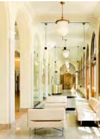
ABOVE AND AT RIGHT: WAYNE N. ASPINALL FEDERAL BUILDING AND U.S. COURTHOUSE GRAND JUNCTION, COLORADO

Following fifteen years of flat funding and declining spending power, GSA's 2014 minor repairs and alterations budget for historic buildings rose 43 percent (representing 44 percent of GSA's nationwide minor repair and alterations program). 11 This is a promising direction for historic buildings which depend heavily on minor repair and alterations funding sources.