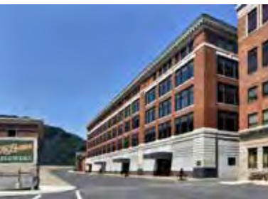
PENN TRAFFIC BUILDING JOHNSTOWN, PENNSYLVANIA

THE INTERNAL REVENUE SERVICE AND U.S. COURTS HAVE HELPED TO KEEP JOHNSTOWN, PENNSYLVANIA'S LARGEST DEPARTMENT STORE, THE 1908 PENN TRAFFIC BUILDING, OCCUPIED SINCE 1989. GSA RENEWED TWO LEASES TOTALING 35,000 SQUARE FEET IN 2014.