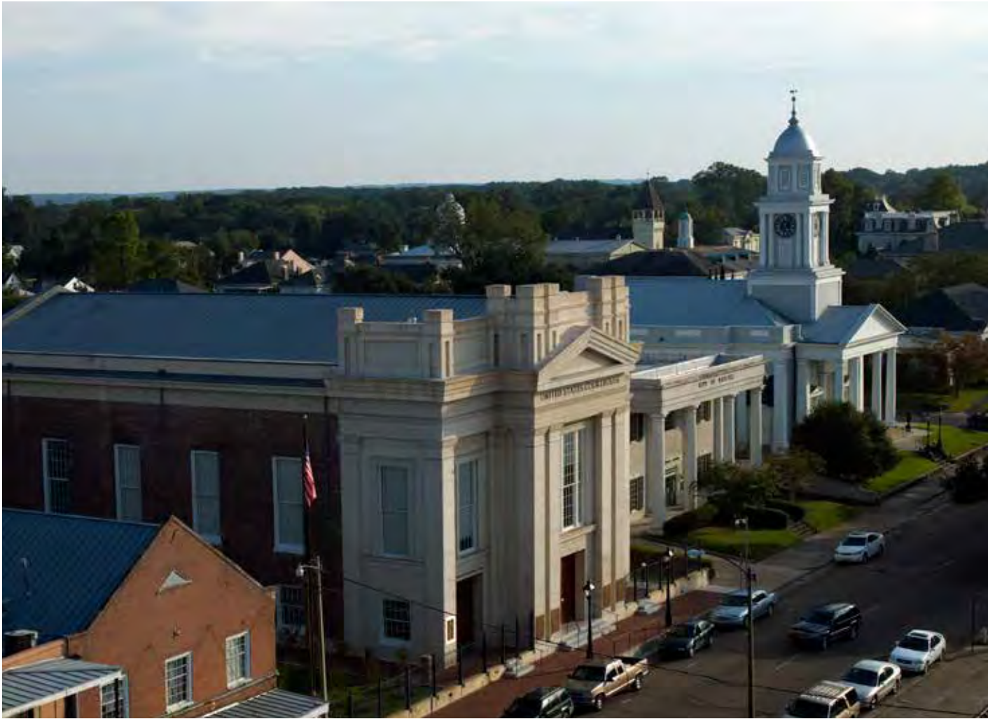
U.S. COURTHOUSE NATCHEZ, MISSISSIPPI