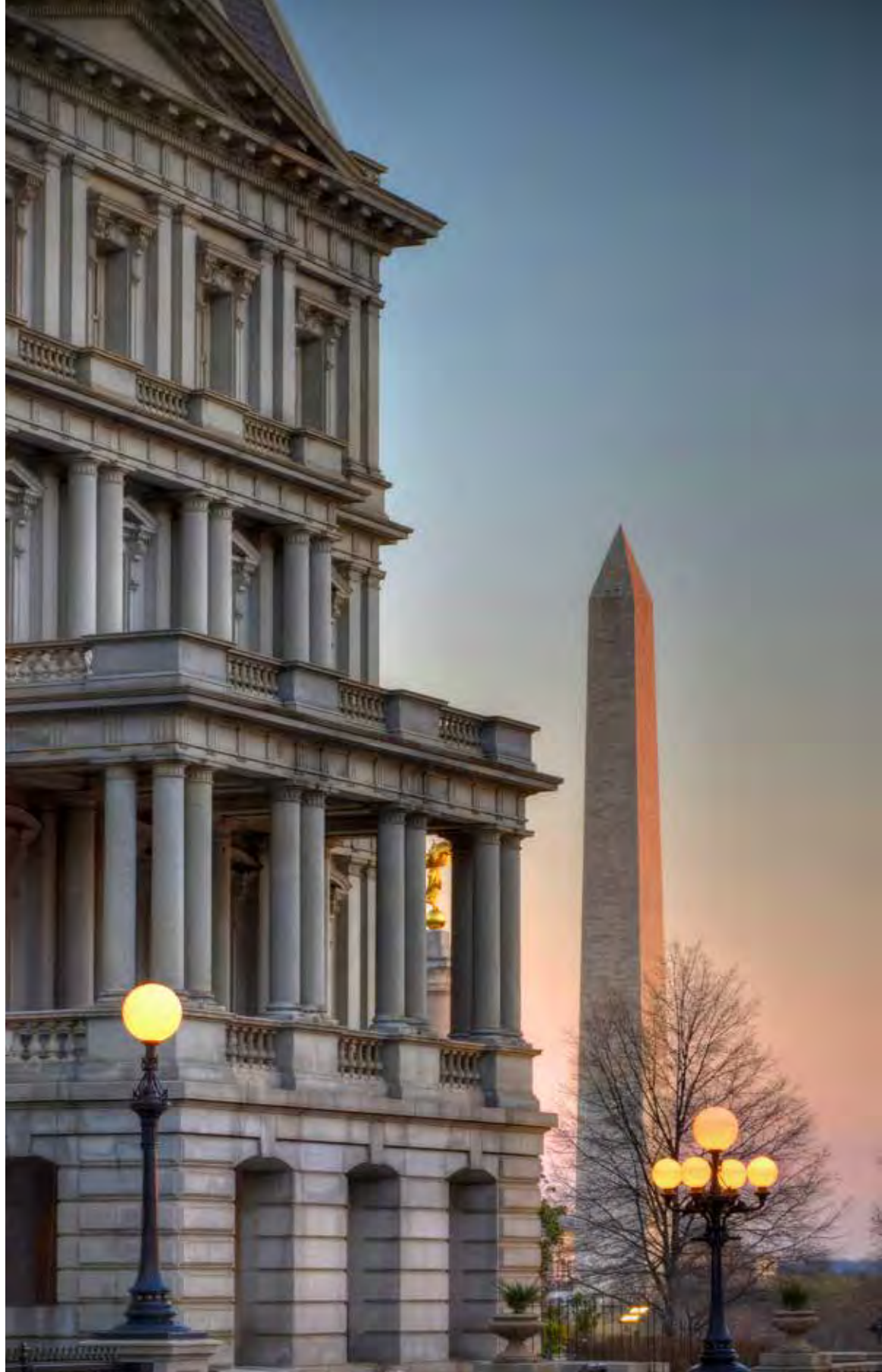
DWIGHT D. EISENHOWER EXECUTIVE OFFICE BUILDING WASHINGTON, D.C.