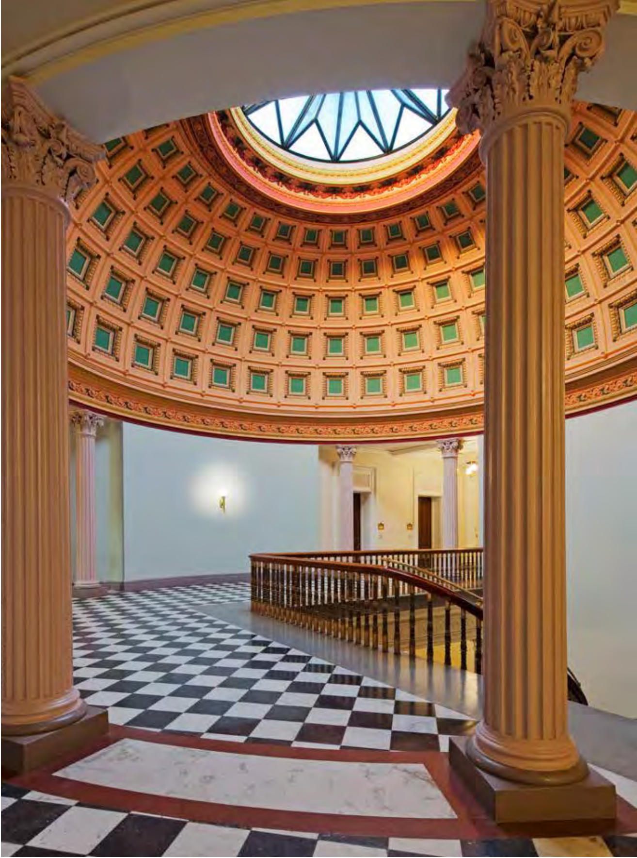
DWIGHT D. EISENHOWER EXECUTIVE OFFICE BUILDING WASHINGTON, D.C.