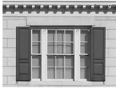
FIGURE 3 Exterior view of 19th century windows repaired and retrofitted with weather-stripping to reduce air infiltration. Properly maintained, some old growth wood sash windows have demonstrated life cycles exceeding 200 years.

Installing weather-stripping and sealing gaps between walls, window frames, and sash to reduce infiltration is one of the most cost-effective ways to achieve substantial energy savings for a small investment. Weather-stripping typically uses a thin, bendable strip of metal such as copper to fill the gap between the door or window sash and frame to exclude cold or unconditioned air. Interior shades and blinds complement infiltration-reducing measures by controlling heat gain. Some products include sensor-driven operating mechanisms that respond to changing daylight conditions. These alternatives are regarded as maintenance repair, from a regulatory standpoint, and require no Section 106 review—a benefit for projects with a limited project delivery schedule.