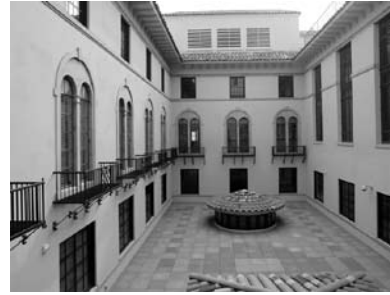
FIGURE 12 Thoughtful analysis to balance GSA preservation, cost, and performance goals supported historic window retention with replacement of non-historic windows at this 1930 courthouse. Blast-resistant, thermal storm windows were installed where original windows remained on courtrooms and the upper and lower levels of the light court.

When analysis strongly supports replacement of window sash or entire window units, consideration must also be given to the feasibility of a combination preservation and replacement approach that retains in place or relocates intact original windows to the building's primary facades or most visible locations (e.g. lower floor levels). As a Section 106 mitigation measure, some GSA projects have preserved sound original windows by consolidating them on the building's lower levels or replacing windows on secondary facades only.