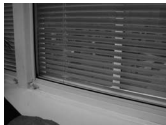
FIGURE 7 Detail views of demountable blast-resistant, thermal storm windows with built-in blinds to control daylight.