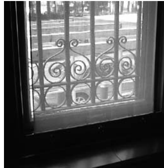
FIGURE 5 Blast shade detail showing fabric anchored to the window frame to contain glass fragments and sash units. Shades can be designed to conform to the contours of arched windows and other unusual openings. (GSA)