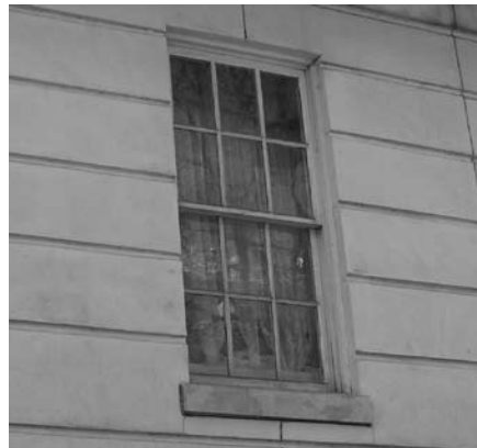
FIGURE 2 As part of every window assessment survey, the presence of rare, costly or difficult to replicate materials, such as the wavy historic cylinder glass reproduced for these mid-19th-century windows, must be identified as features requiring a window retrofit approach rather than replacement.

Any changes that will permanently alter or remove historic features or materials require a compelling justification supported by a systematic and building-specific analysis that takes into consideration preservation goals as well as window performance goals.