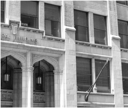
FIGURE 10 Exterior view of blast windows fabricated with custom muntin placing upper and lower panes in separate planes to simulate the appearance of double hung windows.

The slender profiles of some muntins cannot be replicated when blast or insulated glass windows are required. Energy and blast glazing composites are often thicker than single pane glazing, requiring larger muntins and stops to hold the thicker assembly in place. True-divided light (TDL) windows have, in the past, been generally preferred for replicating historic multi-paned windows, but simulated divided light (SDL) sash when properly crafted can produce a convincing effect. SDL use spacers between the panes of the insulated unit, aligned with three-dimensional muntin-grids on the interior and exterior glass surfaces. Keeping the surface grid permanently tight to the surface is critical for effective simulation and can be difficult on very large pieces of glass. SDL offer greater flexibility for matching historic muntin profiles, allowing even narrow muntins to be replicated with insulated units. When replicating any divided light window, specify that replacement windows must match the depth, width and profile of the original window muntins. The addition of insulated glass without the use of a deeper sash will, however, necessitate some compromise in the depth of profiles, and such compromises should generally be made at the interior face.