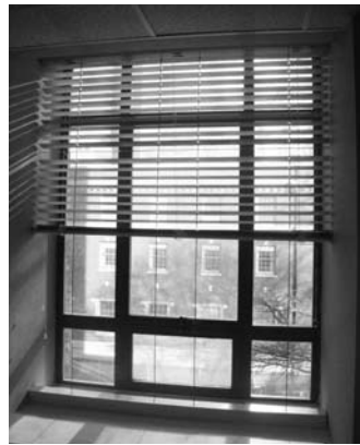
FIGURE 4 Used in conjunction with glazing film, blast blinds retain historic windows while providing improved thermal efficiency and blast protection. Supporting cables are anchored at the top and bottom of the window frame, so blinds can be opened and closed, not raised or lowered. (GSA)

Some storm window products have size constraints that may require designing multiple storm windows with carefully aligned muntins for windows exceeding a given size threshold. The ability of the existing window frame to support added storm sash containing laminated glass must also be confirmed. Some frames will require structural reinforcement. Sash access for cleaning and maintenance must also be considered.