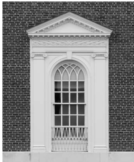
FIGURE 1 Windows are character-defining features in every historic public building. Stone quoins, Ionic pilasters and carved pediments frame multi-light, arched windows defining this Georgian revival facade.

Replacement of historic windows raises preservation and environmental issues requiring more extensive planning, analysis and mitigation to justify the substantial loss of historic materials. Studies exploring historic window replacement need to examine window conditions throughout the building and consider alternatives that preserve as many historic windows as possible. This might entail replacing only irreparably deteriorated windows or consolidating sound windows on principal facades or lower stories most visible to pedestrians.