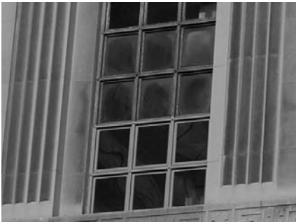
FIGURE 11 Exterior before (top two rows) and after (bottom two rows) views showing original windows and blast resistant replicas illustrates minor muntin-widening needed to secure the thicker laminated glass of the new blast window.

The slender profiles of some muntins cannot be replicated when blast or insulated glass windows are required. Energy and blast glazing composites are often thicker than single pane glazing, requiring larger muntins and stops to hold the thicker assembly in place. True-divided light (TDL) windows have, in the past, been generally preferred for replicating historic multi-paned windows, but simulated divided light (SDL) sash when properly crafted can produce a convincing effect. SDL use spacers between the panes of the insulated unit, aligned with three-dimensional muntin-grids on the interior and exterior glass surfaces. Keeping the surface grid permanently tight to the surface is critical for effective simulation and can be difficult on very large pieces of glass. SDL offer greater flexibility for matching historic muntin profiles, allowing even narrow muntins to be replicated with insulated units. When replicating any divided light window, specify that replacement windows must match the depth, width and profile of the original window muntins. The addition of insulated glass without the use of a deeper sash will, however, necessitate some compromise in the depth of profiles, and such compromises should generally be made at the interior face.