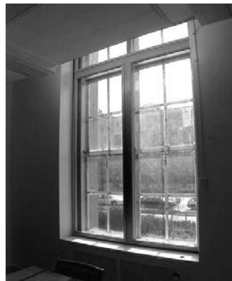
FIGURE 6 Interior views of blast-resistant storm windows. They are designed to contain flying debris, preserve the historic character of building exteriors and interiors, admit daylight, offer energy savings and, with operable product options, allow fresh air inside the building. (Oldcastle-Aral, Inc.)