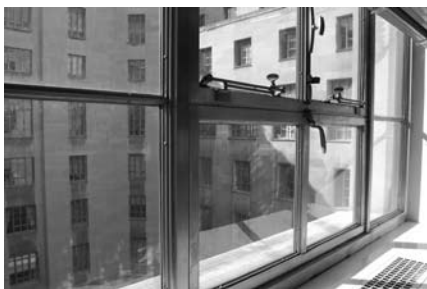
FIGURE 8 Detail views of historic windows retrofitted with laminated glass containing film to resist glass fragmentation and reduce heat gain.

Larger, simpler sash may accept replacement glazing and improve thermal performance without substantially changing the window profiles and detailing. Fanlights and sidelights to exterior historic doors can be similarly retrofitted for improved blast resistance and thermal performance, but as these features are at eye level, the integration of films, new glazing, or panels should be carefully detailed. Overhead skylights and interior lay lights or decorated stained glass should also be reinforced with some measure of protective film or secured glazing to protect persons below.