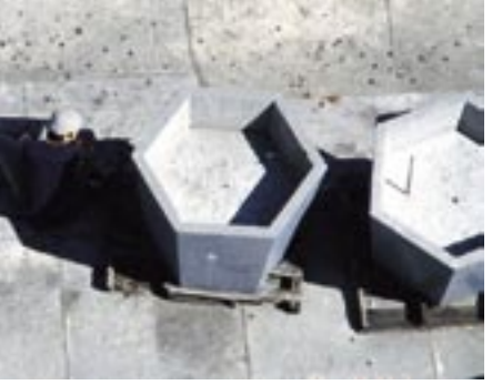
Empty planters, Russell Federal Building, Atlanta, GA.