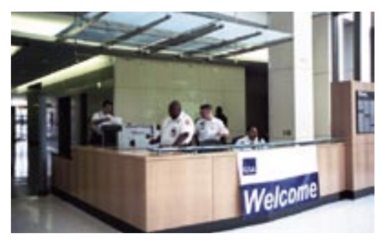
A better solution is to provide a welcoming presence through well-integrated security measures, such as the security desk at the Byron Rogers Federal Building in Denver, CO.