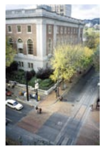
The setback of the Salt Lake City Public Library (above) necessitates an awkward access ramp.

The pedestrian-friendly streets and sidewalks at the Multnomah County Library in Portland, Oregon (bottom) improve the building's openness and approachability.