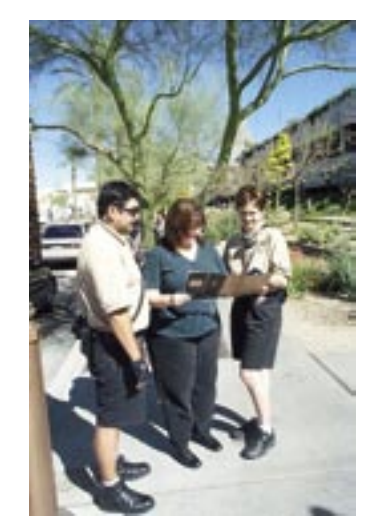
Employees of the Business Improvement District in Phoenix, AZ, review a map of downtown with GSA's building manager.