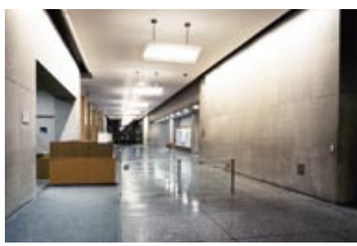
The redesigned lobby of the James A. Byrne U.S. Courthouse, Philadelphia, PA, shown before (top) and after, enhances the visitor experience with improved wayfinding signage and more intuitive circulation.