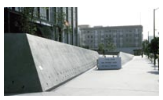
Phillip Burton Federal Building and U.S. Courthouse, San Francisco, CA.

It's unavoidable: safety and security are of paramount concern in these times. But all too often security "solutions" transform a public building into a cold, forbidding place-a veritable fortress. The barriers can be physical, such as ubiquitous concrete Jersey barriers and unrelenting rows of bollards around the property's perimeter, or a matter of logistics, such as a lengthy, intimidating screening process inside the building. Perhaps even more pervasive are the psychological barriers that arise when a building is secured according to the misguided notion that "no people" equals "no problem." The challenge for building managers is to maintain active and open facilities in a time of enhanced vigilance and heightened fear. Washington, D.C.'s Reagan Building (below, bottom right) is a testament to GSA's ability to overcome the fortress mentality: Not only is it one of the country's highest-profile and highest-security federal buildings, but it is also one of the most active, with hundreds of public events held annually.