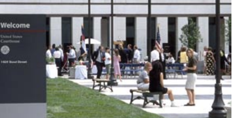
U.S. General Services Administration PUBLIC BUILDINGS SERVICE