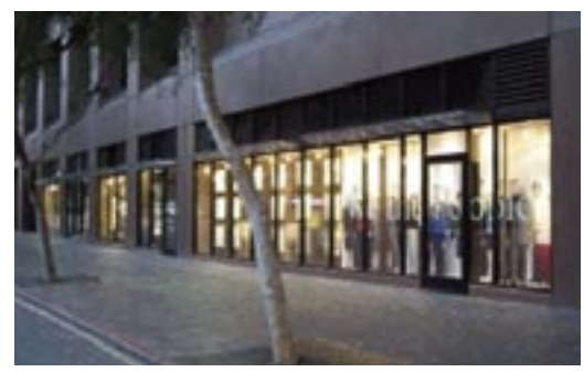
Edward J. Schwartz Federal Building, San Diego, CA, before (top) and after.