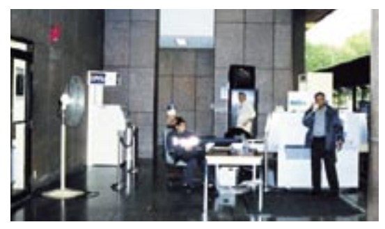
Disorganized interior security not only is inefficient, but can intimidate first-time visitors with its bulk and lack of logical flow.

The way federal buildings are designed and managed to increase security bears enormous significance: Emblems of democracy, they should remain active and open to the public. The challenge for GSA is how to achieve heightened levels of security while providing welcoming public spaces. In an increasing number of cases, GSA properties are secured not by barriers, but by better integrated structural means and careful arrangements for monitoring public access. The design and operation of interior security checkpoints can also be optimized to make the experience of arriving at GSA facilities as efficient and comfortable as possible. By streamlining the process of screening visitors and skillfully integrating security measures into the context of the site, federal buildings can retain the openness befitting democratic institutions.