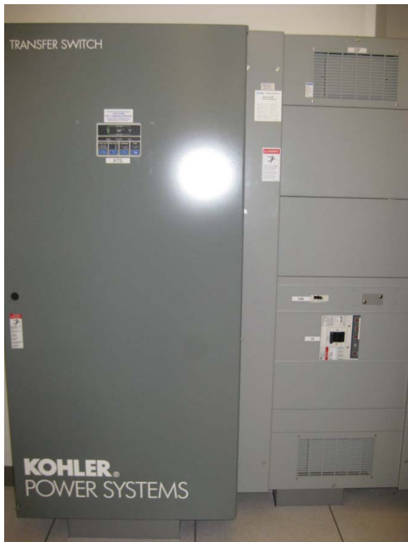
Existing Transfer Switch inside data center, it will be replaced.