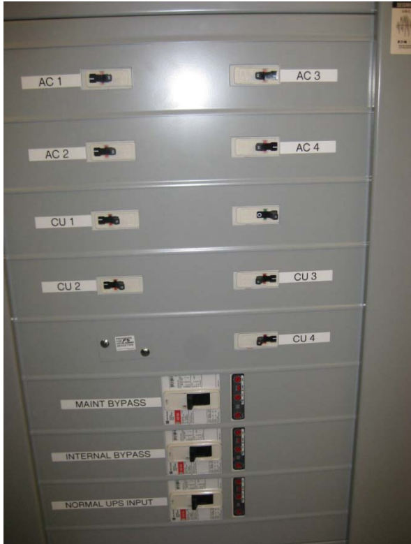
Panel H (600amp)serving data center cooling system and Panel HA