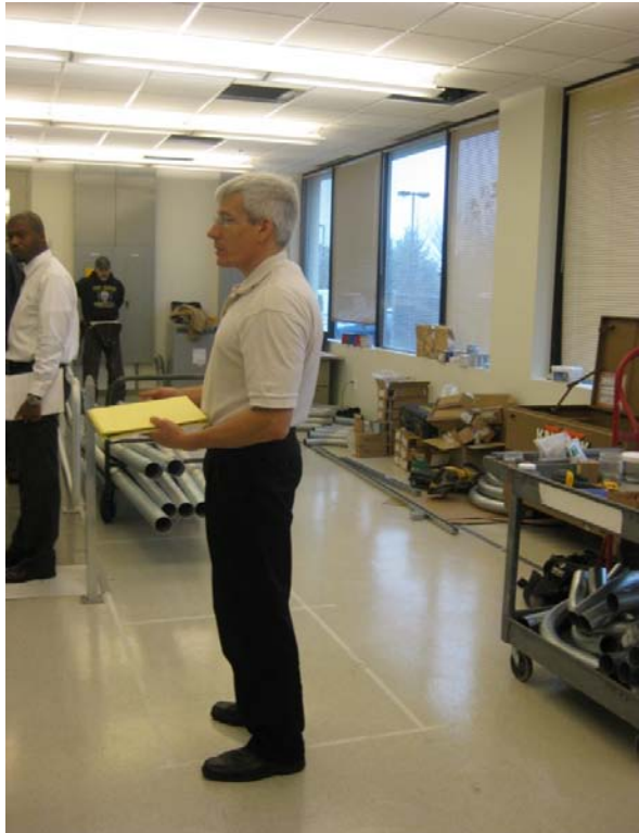
Future UPS and switch boards room, Generators will be installed behind the wall on the right side