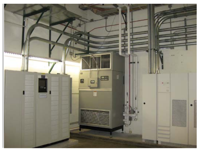
UPS room, two UPS and one CRAH units serving UPS room are shown