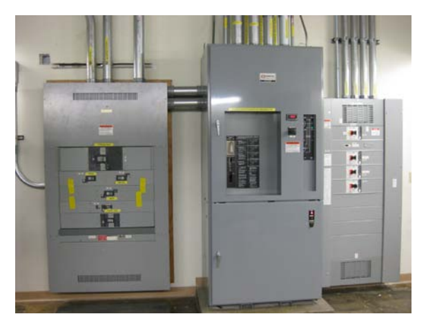
Panel DP-1-UPS in UPS room

Chilled water pipes metering suggested location in AHU room adjacent to data center