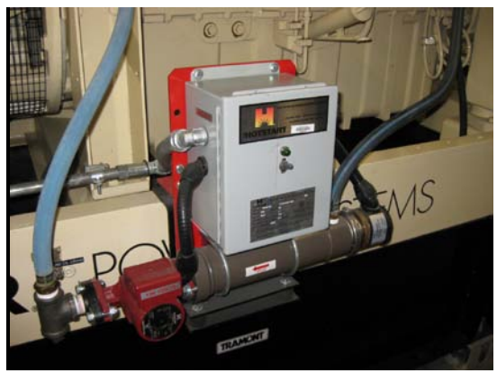
Generator Block heater pump and heater