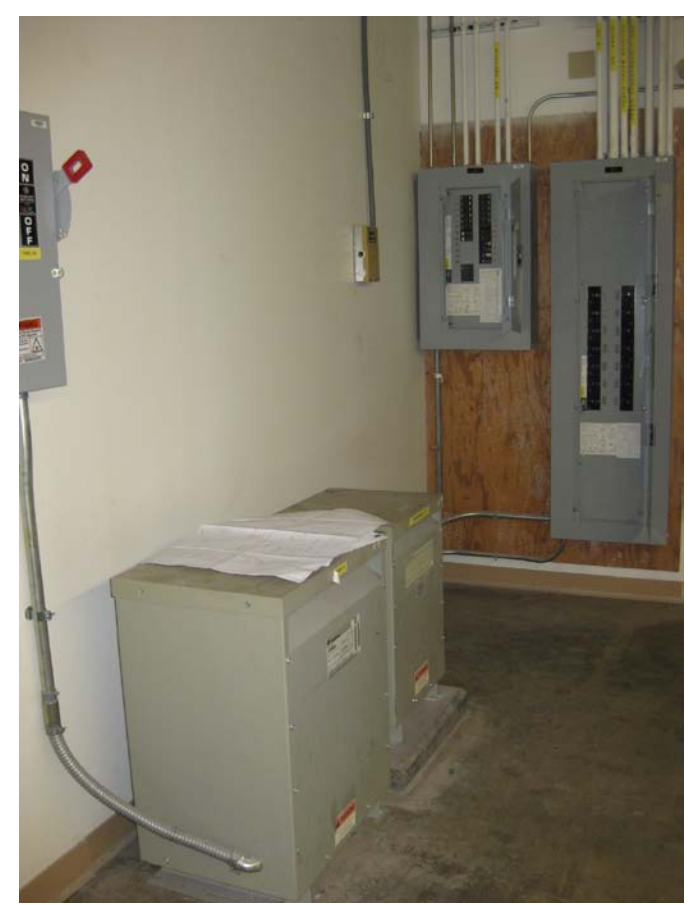
Panel B7A and related transformers in Air Handler room