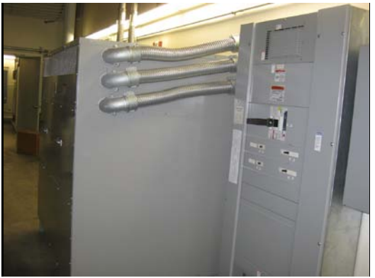
Panel DP-2-UPS in Air Handler room